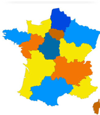
Fig. 1: Information on each specific region can be accessed by clicking on the map

Besides, specific data and advice relevant to each French region can be accessed by clicking on the desired area on the map: