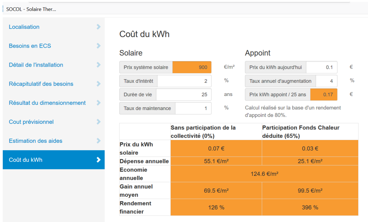
Fig. 3: Simulation results from the OUTISOL software calculations on the SOCOL website

Also to be found on the “Before You Start” page is a set of documents advising on commissioning (a pedagogical document as well as four technical booklets, complete with checklists to take all professionals through the various stages of the projects).